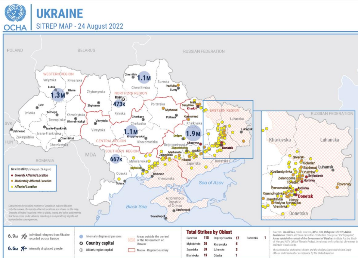
Figure 5.1: UN IOM Situation Report 24 August 2022

In keeping with the timeliness of Lidia's presentation, we have included the latest version of UN Situation Report map she used. Despite the change in Russian military objectives, IDPs continue to be distributed across Ukraine. The total number of IDPs fell by 500,000 to 6.6 million whilst the number of refugees to Europe rose by 1.9 million.