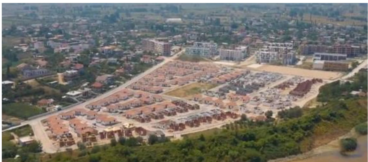
A reconstructed Thumane, Albania

Thumane, a post-earthquake village in Albania, is a good example of how a coherent government management group was able to transform a devastated informal settlement into a well-planned neighborhood with social infrastructure.