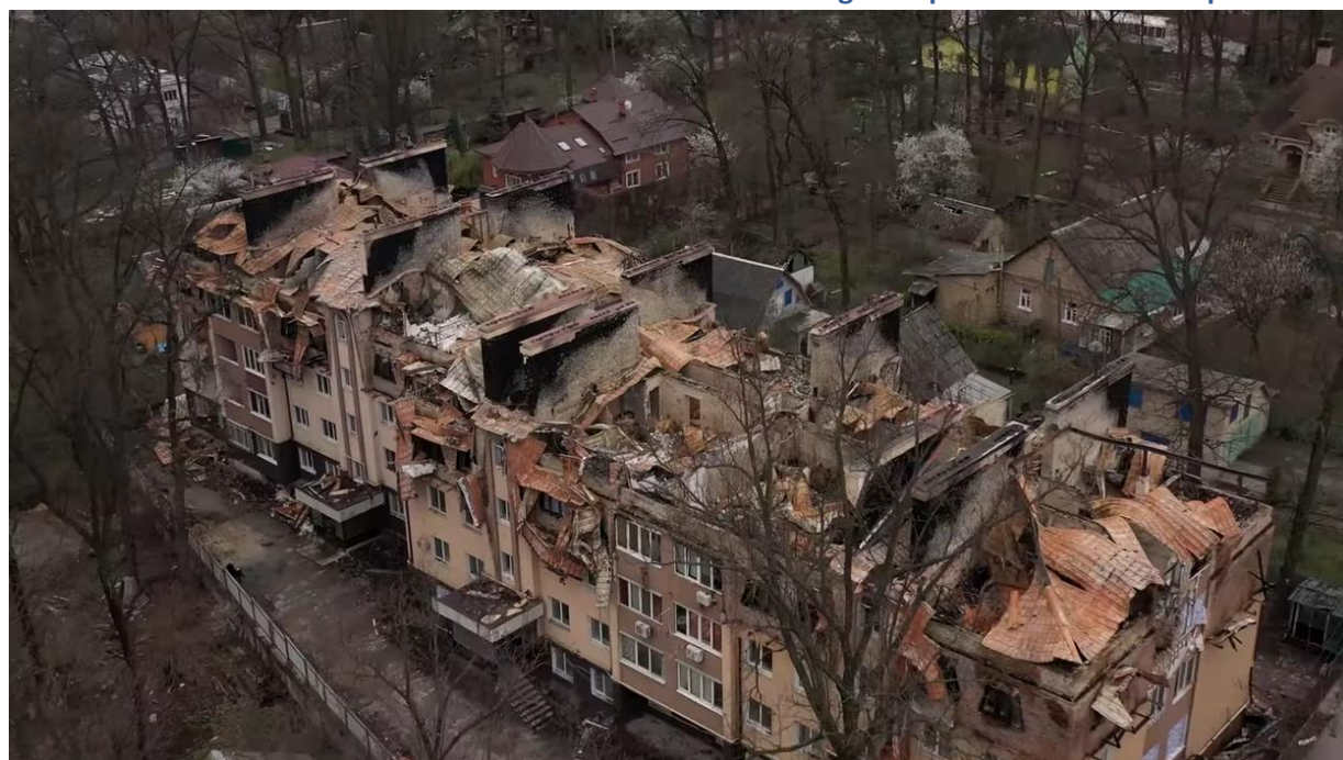
Damage to apartment blocks in Irpin video