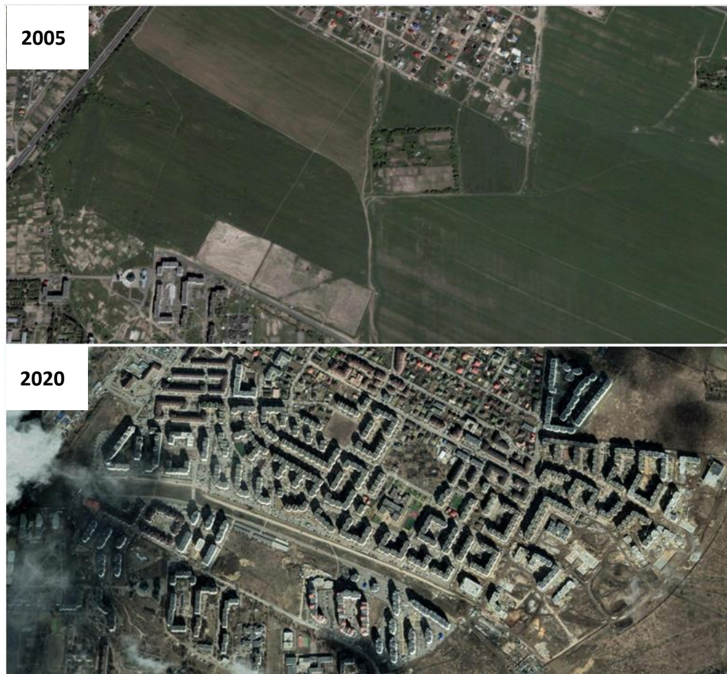
Figure 3.2: The development of Sofiivska Borschahivka 2005 to 2020